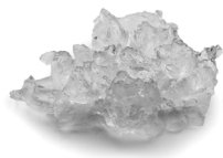
AF 124 Flake ice Residual water content 25%