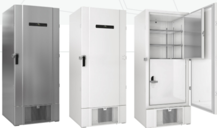
The BioUltra UL570 is available with right hinged door. All BioUltra UL570 cabinets are equipped with insulated inner doors and 2 access ports.

IQ, OQ documentation for all BioUltra UL570 models are available for download on www.gram-bioline.com .