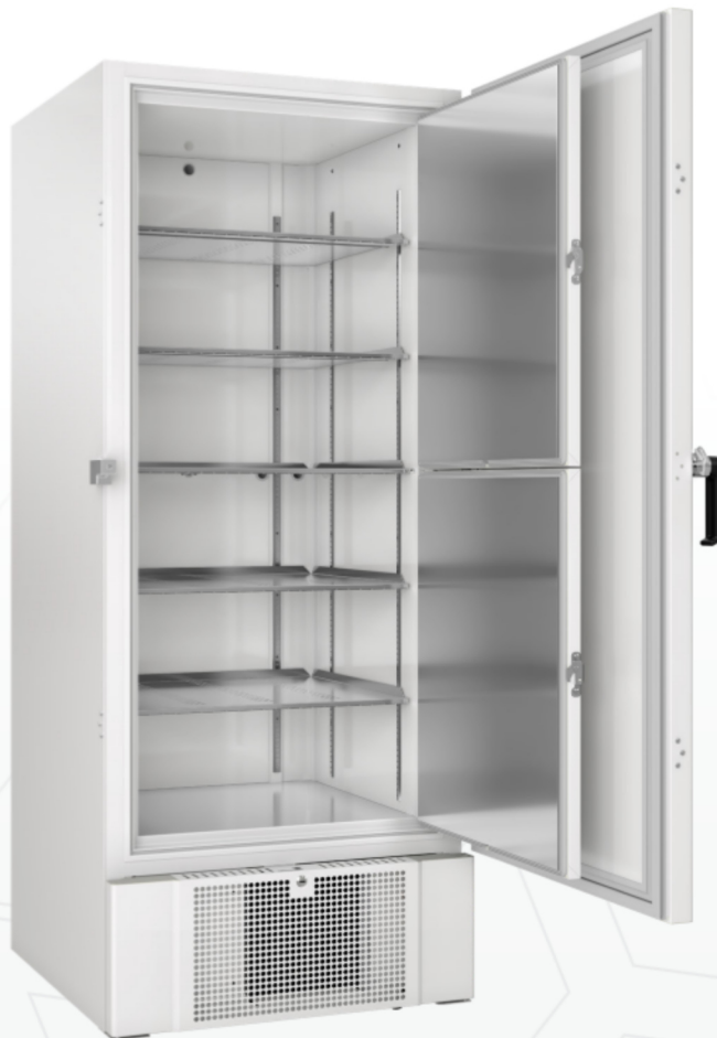
BioUltra UL570 comes with 5 perforated stainless steel shelves.

The BioUltra UL570 is an ultra low temperature freezer that operates safely at -86^{\circ}\text{C} . Utilising high-capacity components, cascade refrigeration system, latest generation VIP-technology and insulated inner doors, the BioUltra is able to maintain safe and stable interior conditions when operating at -86^{\circ}\text{C} .