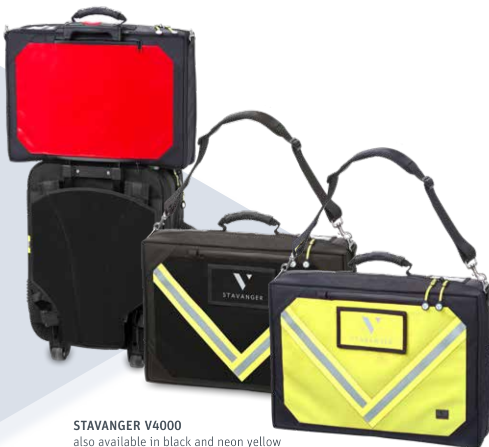
STAVANGER V4000 also available in black and neon yellow