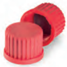
High Temperature Screw Cap Red, PBT, Cap liner