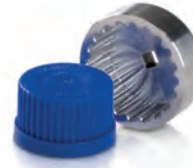
Torque wrench socket fitting for PP Cap*