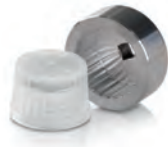
Torque wrench socket fitting for PREMIUM Cap*