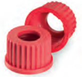
Aperture Screw Cap Red, PBT