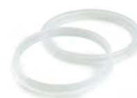
Pouring Ring • White, PTFE