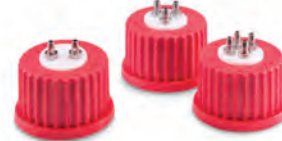
Multiport Connector Cap 2-, 3- or 4-ports, PTFE with stainless steel connectors