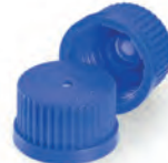
Screw Cap Membrane Vented Blue, PP