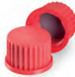
High Temperature Screw Cap Red, PBT, Cap liner