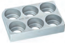
ANSI/SLAS Microplate Holder for 10 or 25 mL bottles