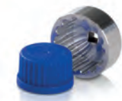
Torque wrench socket fitting for PP Cap*