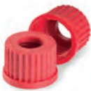
Aperture Screw Cap Red, PBT