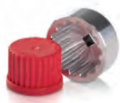
Torque wrench socket fitting for PBT Cap*