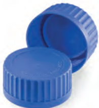
Screw Cap • Blue, PP, Linerless