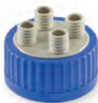
Multiport Connection Cap • 4-ports, Blue, PP