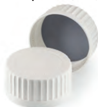
PURE Screw Cap • White, PSU, Cap liner