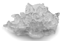
MF 36 Flake ice Residual water content 25%