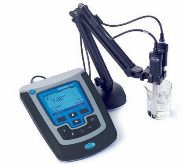
HQD benchtop multi-meter