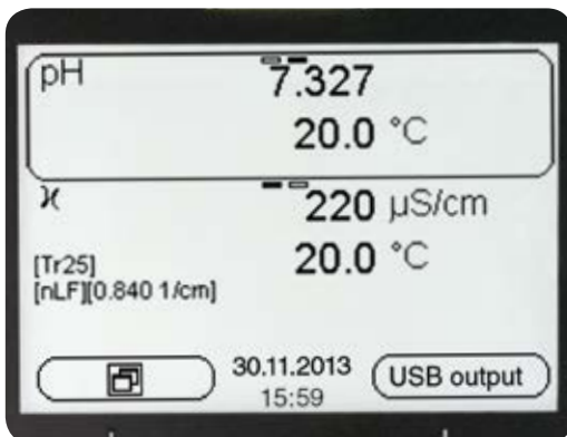
Display with two measured values