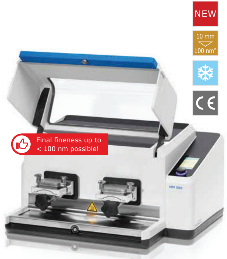
Mixer Mill MM 500