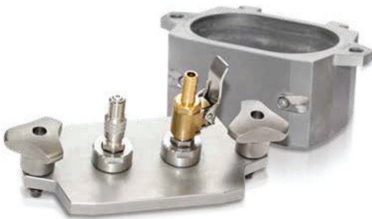
Screw-Lock grinding jar with integrated safety closure device and aeration lid.

The benchtop unit is also used for classic dry, wet and cryogenic grinding of sample volumes up to 2 \times 45 \text{ ml} in one step. This powerful mill mixes and pulverizes powders and suspensions in a matter of seconds.