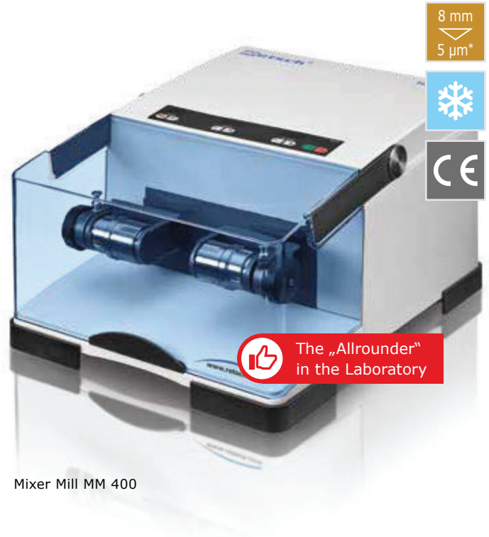
Mixer Mill MM 400