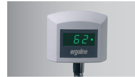
Patient display showing speed