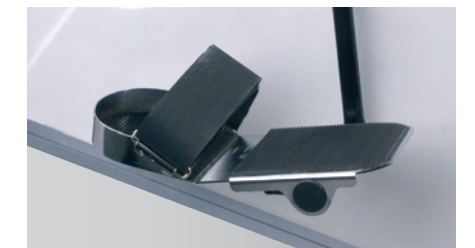
Pedal shoes with Velcro ties