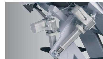
Motor adjustment for "incline" and "tilt"