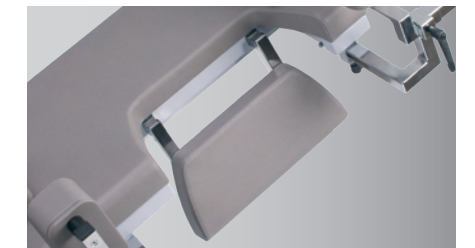
Padded drop section for ultrasound examinations