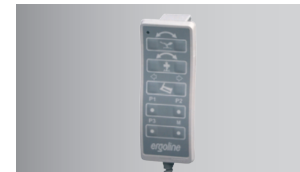
Memory control unit (motor control)