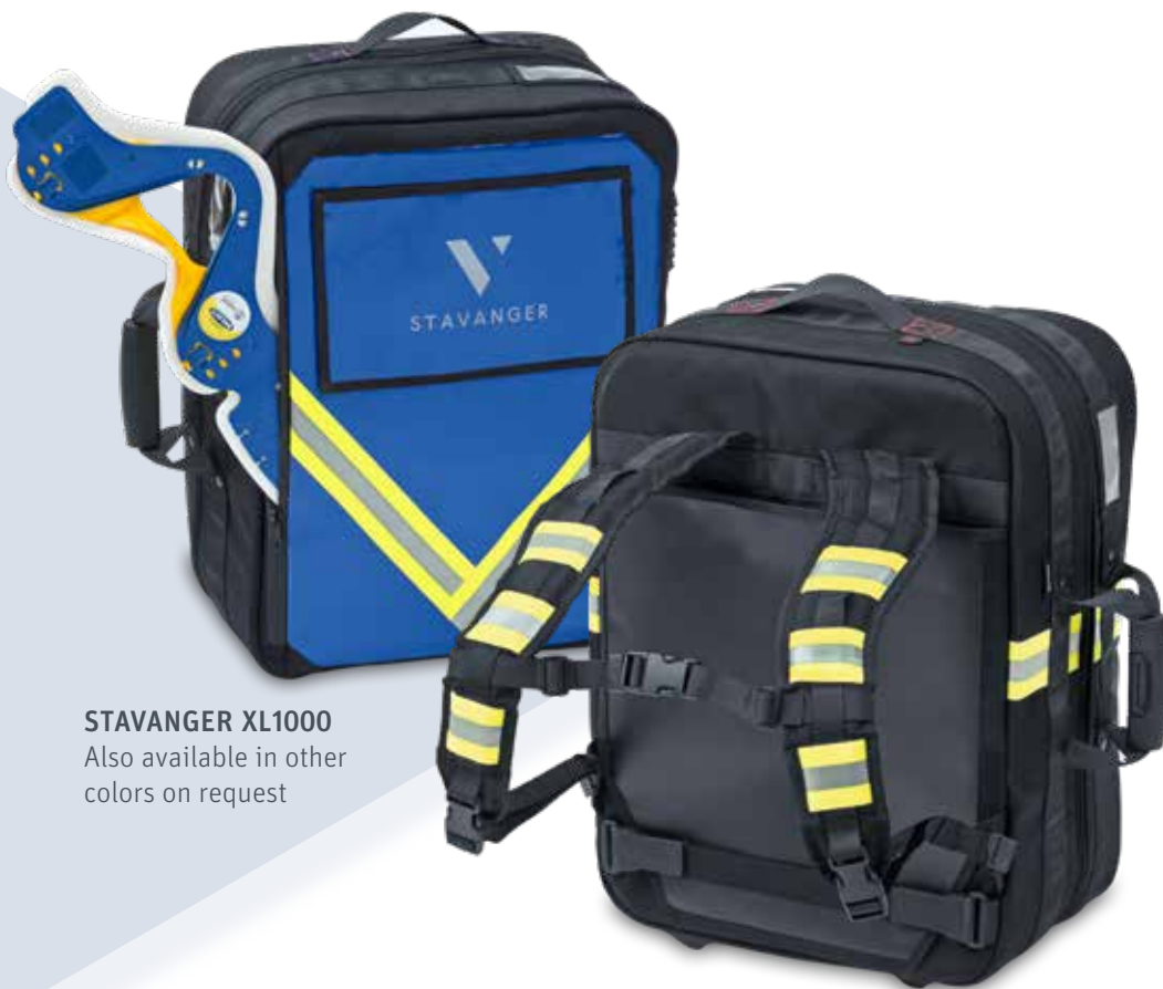
STAVANGER XL1000 Also available in other colors on request