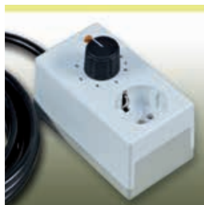
Power controller HM-L116