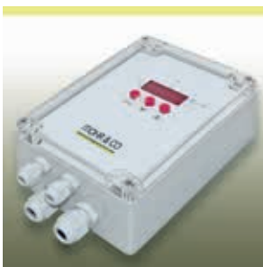
Electronic temperature regulator HM-DTR

For temperature regulation we suggest our program of electronic control and temperature regulation appliances and corresponding temperature sensors.