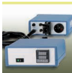
Electronic laboratory regulator series HM-RX1000