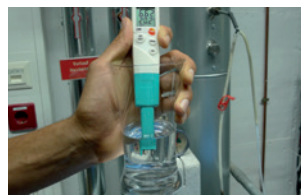
Ideally suitable for monitoring heating system water according to VDI 2035.