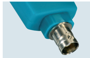
testo 206-pH3: pH3 probe head with BNC interface